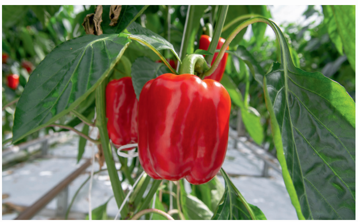
Bell peppers are a consistently popular vegetable with consumers

Bell peppers, especially red, yellow and orange, consistently rank among the top 10 most popular fruit both in North American and in European countries. It's important for growers seeking to capitalize on the fruit's popularity to understand the common challenges with growing this crop. Bell peppers have long cultivation cycles and are particularly susceptible to water stress, resulting in reduced fruit quality.